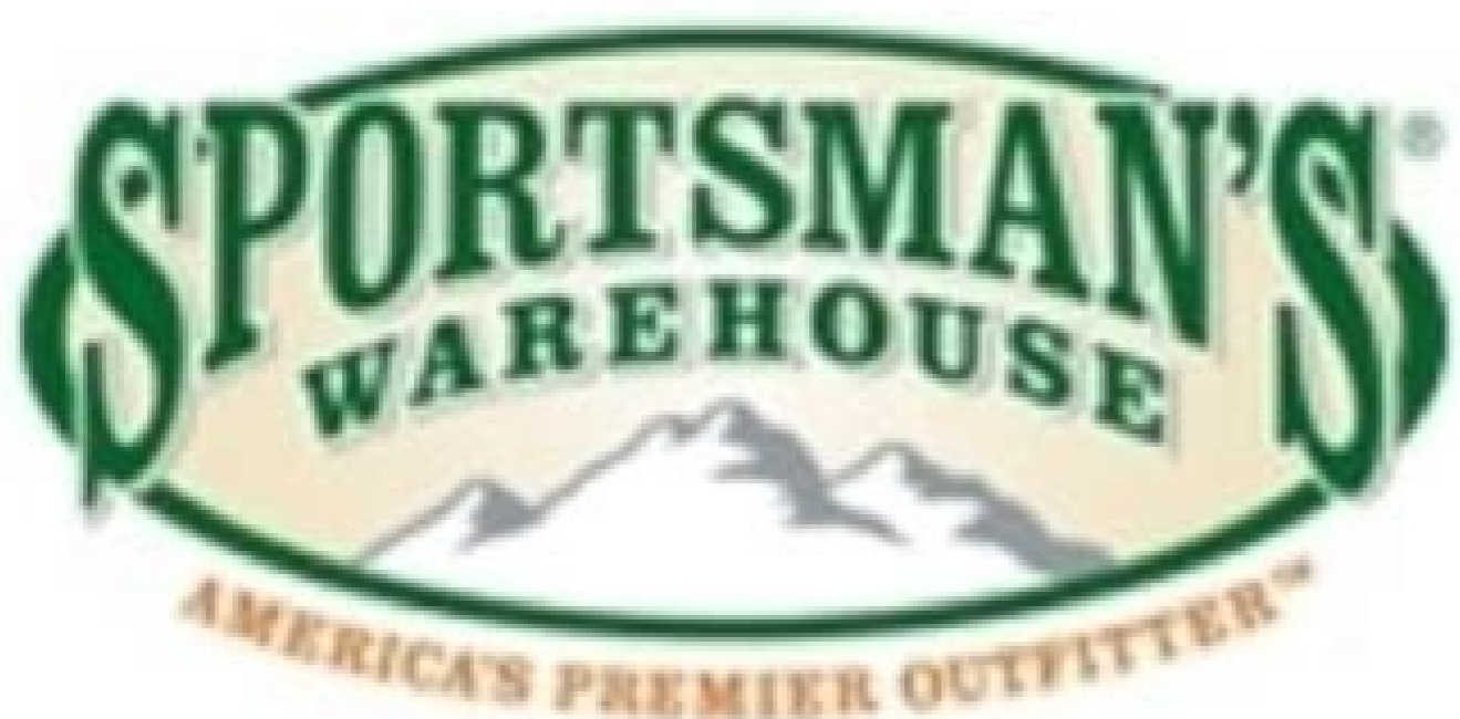
Sportsman's guide buyer's club 4 pay. Is sportsman's guide legit.